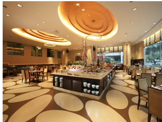
TONKA BEAN CAFÉ

A modern and spacious room at 36sqm for your comfort. Enjoy your buffet breakfast at Tonka Bean Café with Malaysian and International cuisine.