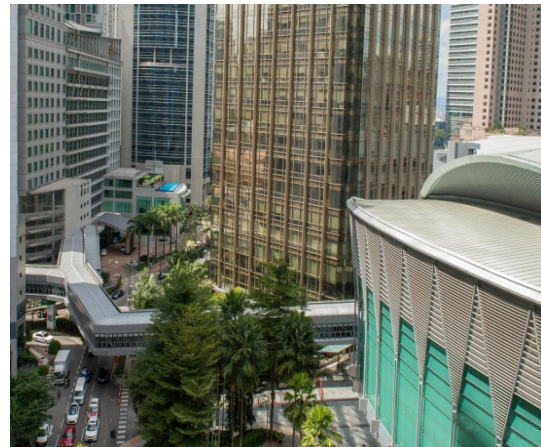
DIRECT LINK TO KL CONVENTION CENTRE (KLCC) VIA THE SKYBRIDGE

Located in the heart of the Kuala Lumpur (KL) City Centre, Impiana KLCC Hotel is positioned among the majestic Petronas Twin Towers and the ultra-modern Kuala Lumpur Convention Centre.